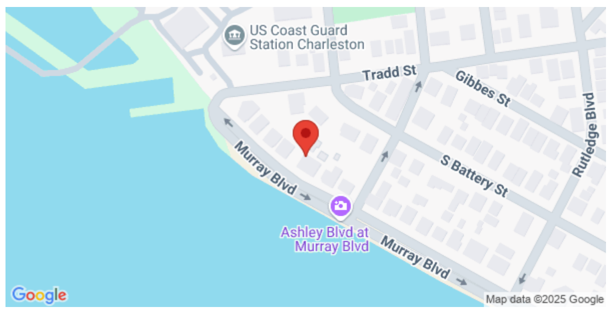
100 Murray Boulevard, Charleston, 29401, SC