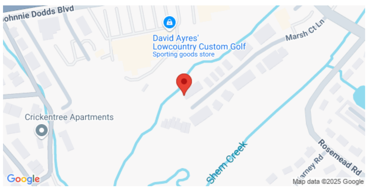
1077 Marsh Court Lane, Mount Pleasant, 29464, SC