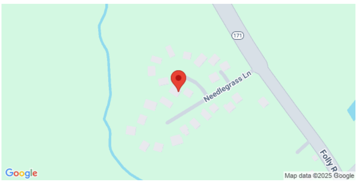
2107 Club View Court, Charleston, 29412, SC