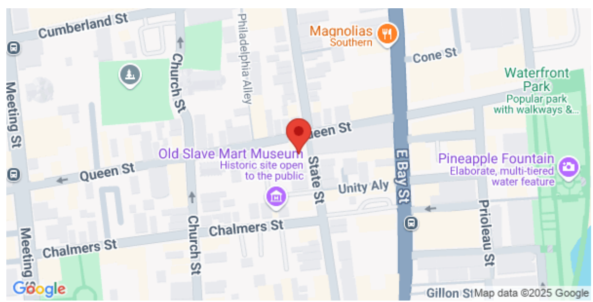
27 State Street, Charleston, 29401, SC