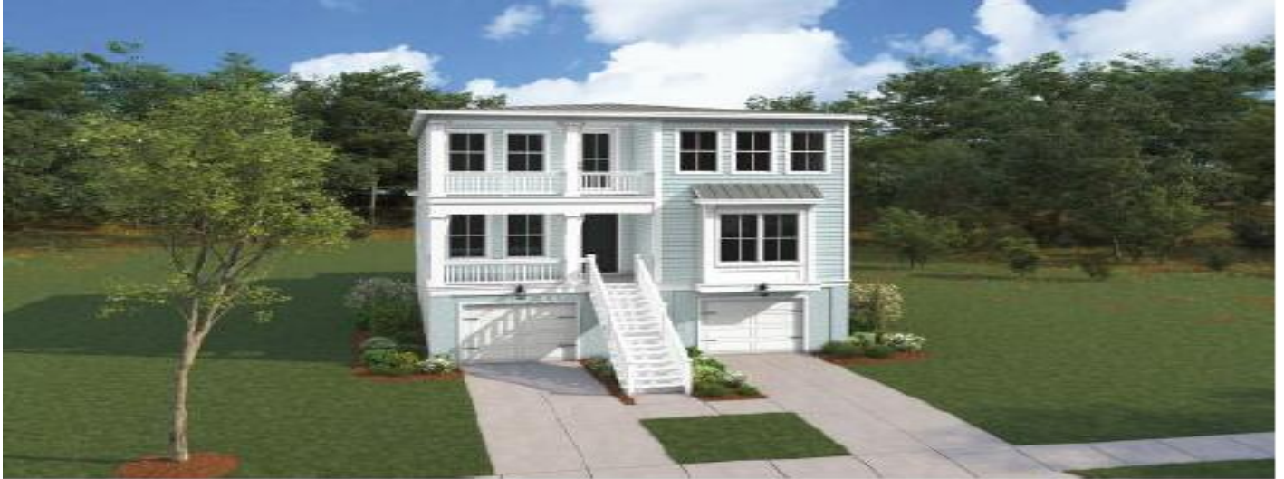
ELEVATION G ✓

https://jamesschiller.com/properties/716-minton-road/charleston/sc/29412/MLS_ID_25007650