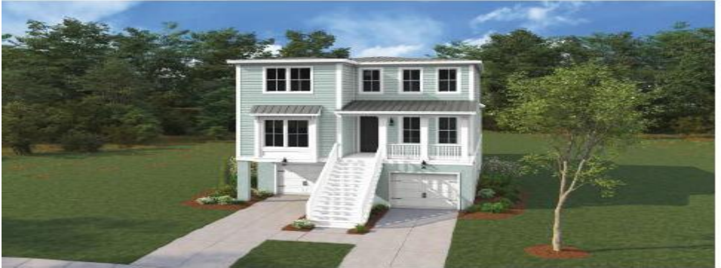
ELEVATION E ✓

https://jamesschiller.com/properties/718-minton-road/charleston/sc/29412/MLS_ID_25007656